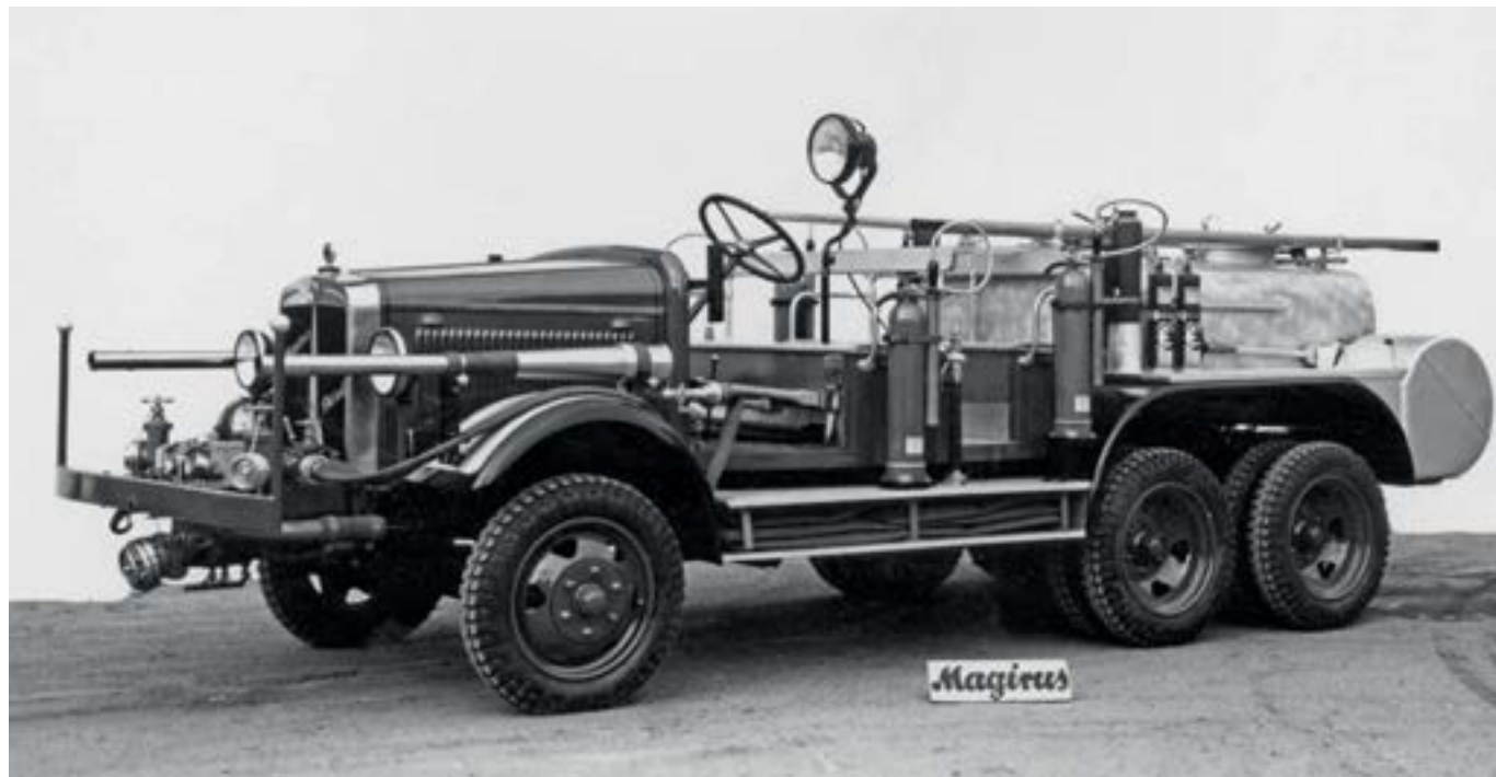
/ The first Magirus airport fire-fighting vehicle from 1930.

It is the people at Magirus, the developers, the engineers, the technicians, welders and fitters who stand for the quality of all Magirus developments. Those who bet their life that each Magirus airport fire-fighting vehicle offers proven reliability and superior technology, even under the toughest conditions.